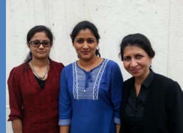
Helping Hands Committee

The teachers expressed their willingness to extend help to the orphanage of Tree of Life Society. Students were encouraged to donate clothes and toys for charity which was duly handed over to the society. Students and parents were very generous with their donations and made this project of Helping Hands a success.